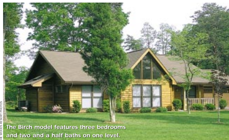
The Birch model features three bedrooms and two and a half baths on one level.