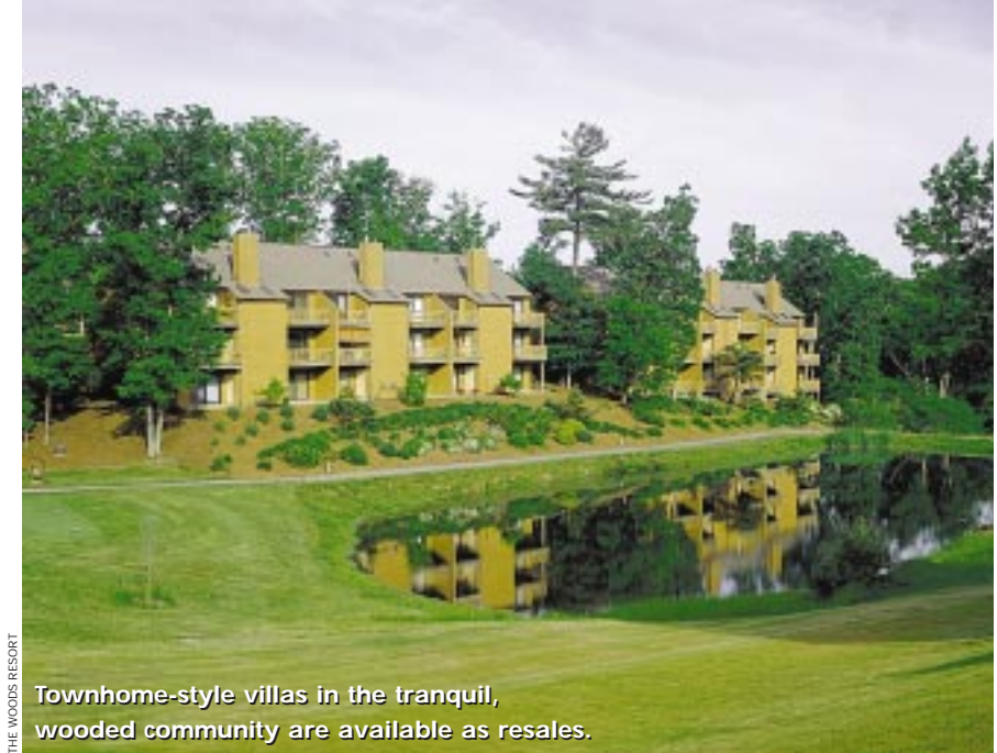
Townhome-style villas in the tranquil, wooded community are available as resales.

The Gundersons say the mid-length course is great for new golfers and opens up the conventional course for