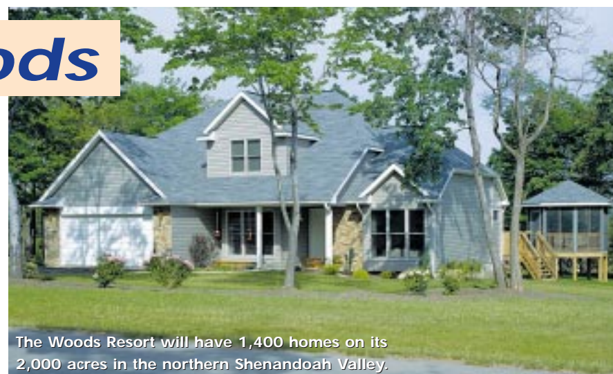
The Woods Resort will have 1,400 homes on its 2,000 acres in the northern Shenandoah Valley.